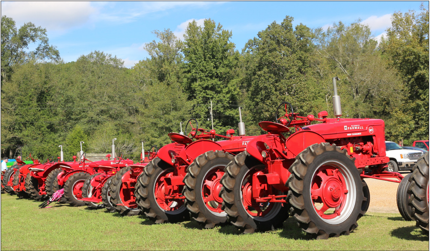
The Jean's on the River show, not far from Cordova in Walker County always attracts a lot of red tractors, and the Fall 2018 show was no exception. The show takes place on the grounds of "Jean's on the River" restaurant, which sits on a bluff overlooking the Mulberry Fork of the Warrior River near U.S. 78. Early arriving exhibitors are treated to a free breakfast if they have an appetite.