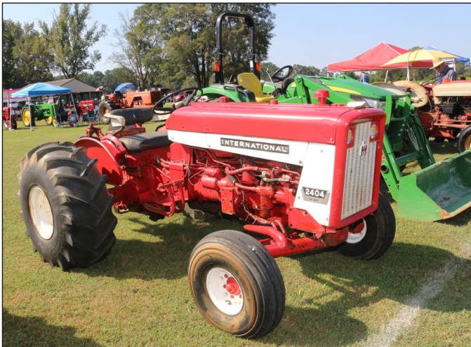
An unusual sight at the St. Florian show was this International 2404 Lo-Boy. These tractors were only manufactured for two years during the mid-1960's.