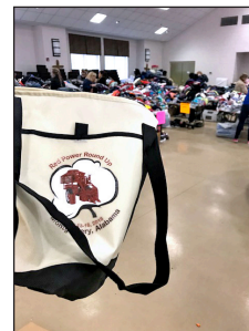
A RPRU 2018 tote bag shown in the area where donations were distributed to victims.

explaining this critical need and asking anyone with spare tote bags to contribute them right away to this worthy effort.