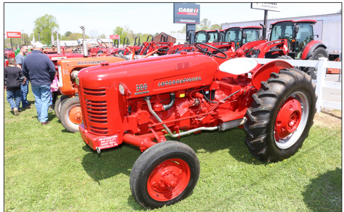
Another recently completed project shown for the first time at Snead was Gary Bell's IH 300 Utility, known as the "Elvis Tractor".