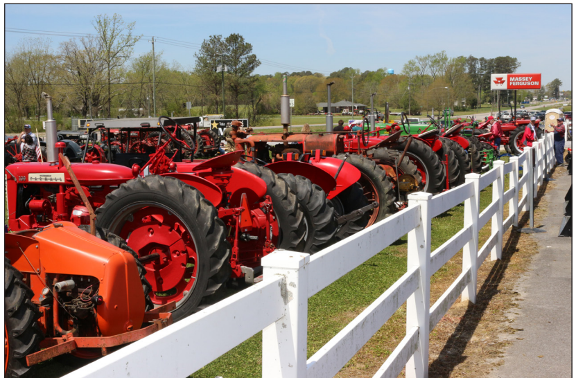
The show at Snead Equipment is a great early season show each year – always with a good turnout and lots of variety.