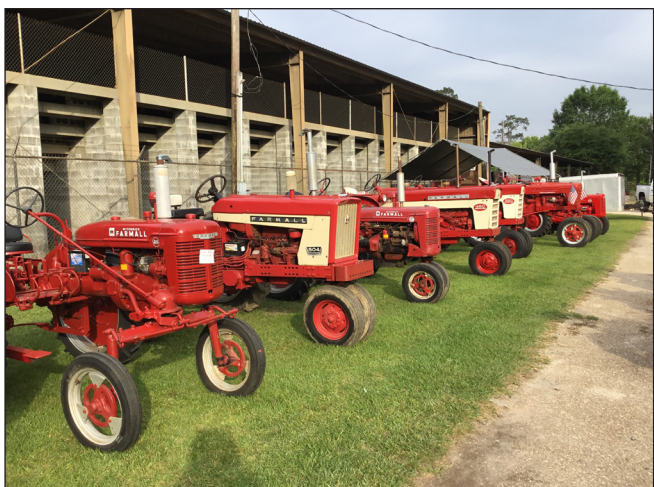
A nice line of red tractors at the Louisiana State Show at Franklinton, LA held on May 4-5.